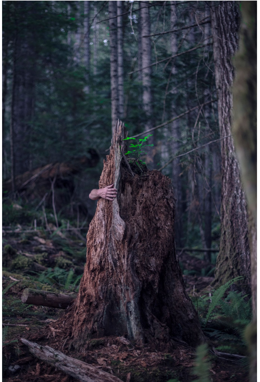
Photograph by Raul Velasco, LCW Photo Contest Winner